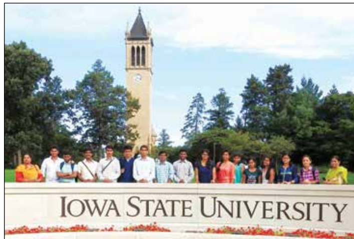
Students attending the training course at Iowa State University, Ames, USA