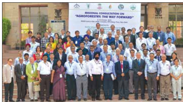
Participants for Regional Consultation on Agroforestry, New Delhi

The participants of the Regional Consultation have agreed on the following plan of action for promoting agroforestry in both Indian and regional contexts which was adopted as New Delhi Declaration.