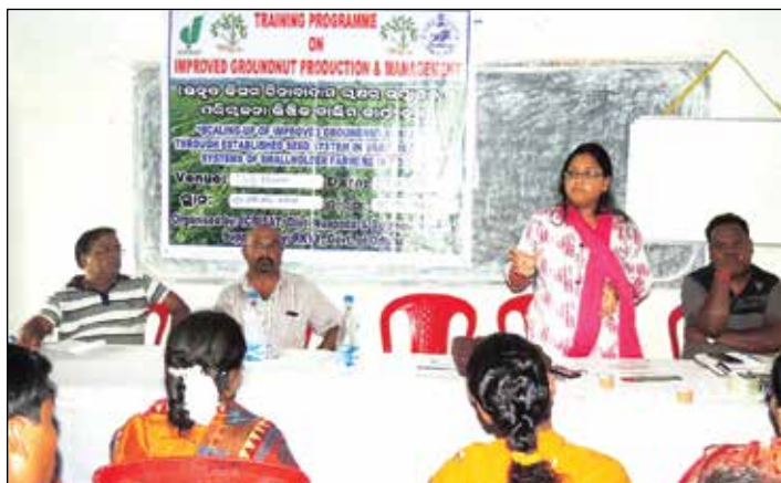
Training program on seed production in groundnut

Agriculture and Technology was supplied to some farmers to take up foundation seed production.