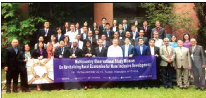
Multi-Country Observational Study Mission, Chinese Taipei

The Council of Agriculture (COA), Executive Yuan, China Productivity Center and the Asian Productivity Center together with APAARI co-organised a Multi-Country Observational Study Mission on Revitalizing Rural Economies for More Inclusive Development on 14 -18 September 2015 in Chinese Taipei. The aim of the study mission was to study the policy and institutional settings for better revitalization of rural economies as well as to learn from the strategies, approaches, and successful models used to revitalize the host country's rural economies. The participants would then be able to formulate strategic action plans to utilize for the revitalization of their own rural economies and disseminate findings of the study mission in their own respective countries. The study mission consisted of visits to sites of successful cases of revitalization of local economies in the host country, theme presentations, sharing of experiences among member countries, and individual/group exercises. APAARI nominated six participants from Vietnam, Nepal, the Philippines, Pakistan, and Bangladesh.