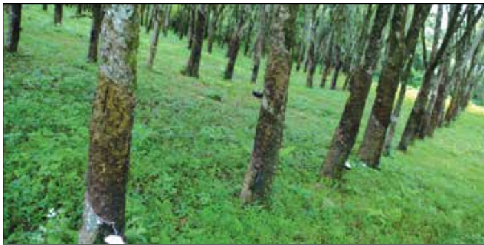
A rubber plantation in Antipas, North Cotabato

Currently, the rubber industry faces uncertain prospects due to large areas with senile trees and the consequent productivity drop and limited replanting. Of the total 161,000 hectares planted under rubber, about 80,000 hectares are over-exploited and are due for replanting. While some farmers as