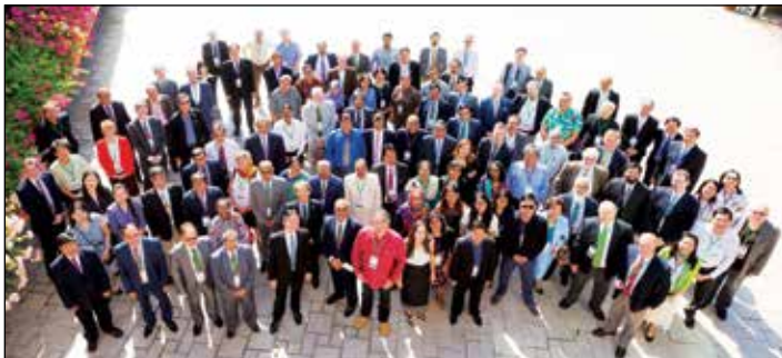
Participants of the High Level Policy Dialogue, Bangkok

The focus of the Dialogue was on discussing the direction, needs and mechanisms to enhance and improve investments (financial, infrastructure, capacity development and policy support) in agricultural research and innovation systems (including extension and education) that can contribute to improving the region's overall agriculture and agri-food systems and achieving the Sustainable Development Goals (SDGs). The immediate purpose of the Dialogue was to catalyze policy/decision makers, re-sensitize NARS, and create an environment for increased resource allocation and congenial policy environment for agricultural research and innovation for sustainable development in Asia and the Pacific.