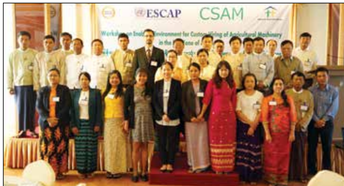
Participants of Knowledge-Sharing Workshop, Mandalay

The Centre for Alleviation of Poverty through Sustainable Agriculture (CAPSA) of the United Nations Economic and Social Commission for Asia and the Pacific (UNESCAP), based in Bogor, Indonesia, is leading the implementation of the project “An Integrated Rural Economic and Social Development Program for Livelihoods Improvement in the Dry Zone of Myanmar” in partnership with the Asian and Pacific Centre for Transfer of Technology (APCTT-ESCAP), Centre for Sustainable Agriculture Mechanization (CSAM-ESCAP), Network Activities Group (a national NGO), and the Department of Rural Development of the Ministry of Livestock, Fisheries and Rural Development of Myanmar. The project, funded by the Livelihoods and Food Security Trust Fund (LIFT), aims to support an improved enabling environment for integrated socioeconomic development, with special emphasis on livelihoods improvement and food security, in Myanmar's Dry Zone which suffers from a high incidence of poverty.