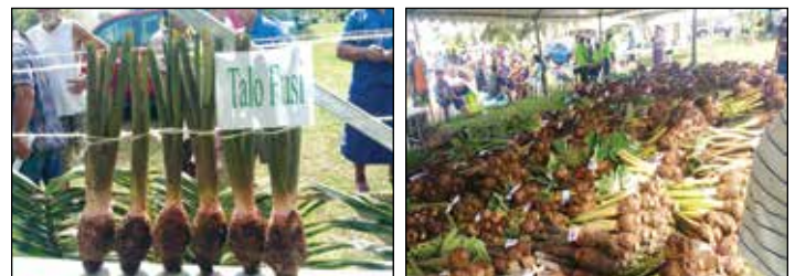
New taro varieties launched during the Samoa Agriculture Show

Export of taro varieties Samoa 1 and Samoa 2 varieties have risen dramatically between January 2014 and June 2015, which accounts for approximately 1.5 million taro saplings exported, based on figures from the MAF taro pack-house. The number of containers of taro exported by Samoa to New Zealand and the United States of America has also increased from 4 to 16 containers per month, and this figure is expected to further increase.