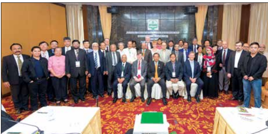
Participants of APAARI Executive Committee Meeting, Bangkok, Thailand