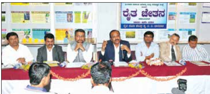
Psychiatrists counseling the farmers at UAS, Dharwad, India