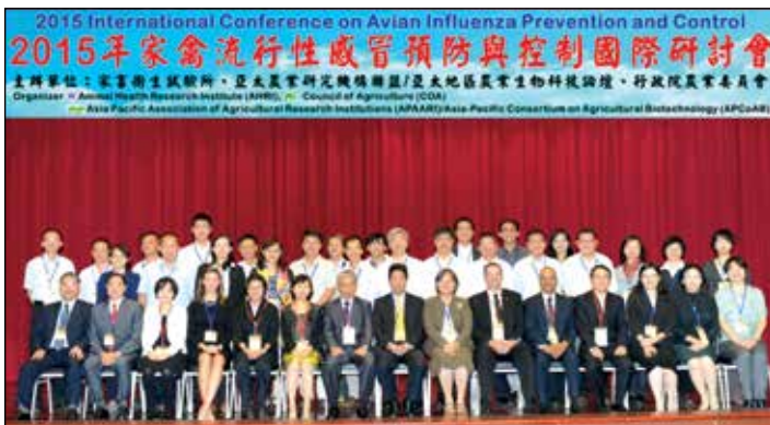
Participants of the International Conference on Prevention and Control of Avian Influenza, Chinese Taipei