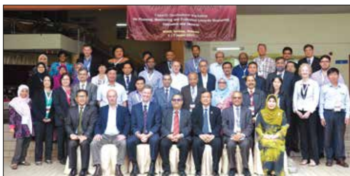
Participants of Capacity Development Workshop, Kuala Lumpur, Malaysia

The experience in organizing this workshop shows that ongoing encouragement and support is extremely necessary. It was