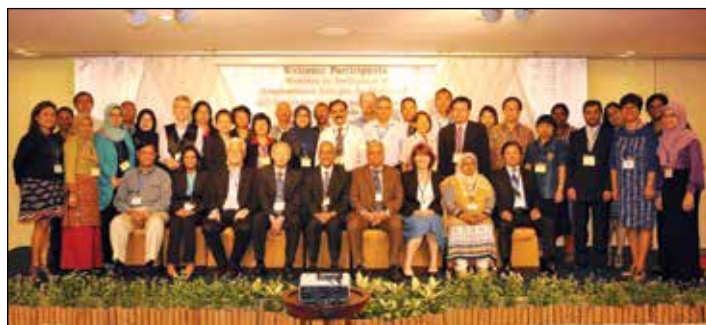
Participants of Workshop on Development of Communication Strategies for Adoption of Agri-Biotechnology