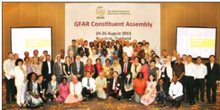
Participants of GFAR Constituent Assembly, Bangkok

The GFAR Constituent Assembly organized at Bangkok on 24-26 August 2015 brought together over 100 representative stakeholders from all sectors and all regions, to consider and renew the role, purpose and governance of GFAR. This landmark Assembly formed a key step in a process of governance review, reform and renewal of the Global Forum, responding to the fact that much has changed in the world of agricultural research and innovation since the Forum was first established in 1996.