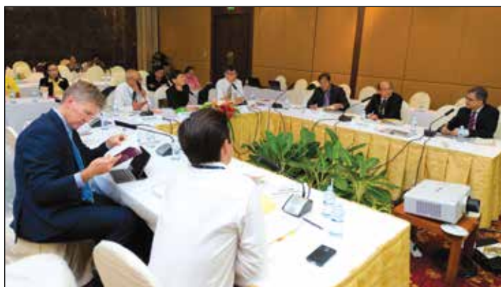
APCoAB Steering Committee Meeting, Bangkok