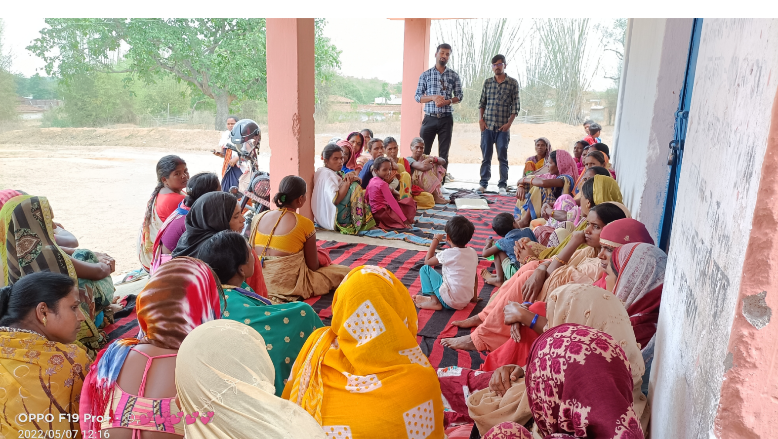
Meeting with community collectives to promote cultivation of high value crops at Ranchi, Jharkhand

are from the community and work for the community. The community institutions are positioned as the anchor for this model and act as nodal points for this value chain actor (agrientrepreneur). These linkages enable the community to access credit, input supply, improve knowledge about agricultural practices and create sustained market linkages. These services are embedded in the profile of an agri-entrepreneur who is responsible for last mile service delivery. Both these models in this framework work in tandem to create sustainable multidimensional change and empower community institutions and members to work with these actors so as to imbibe these changes into their lives and livelihoods.