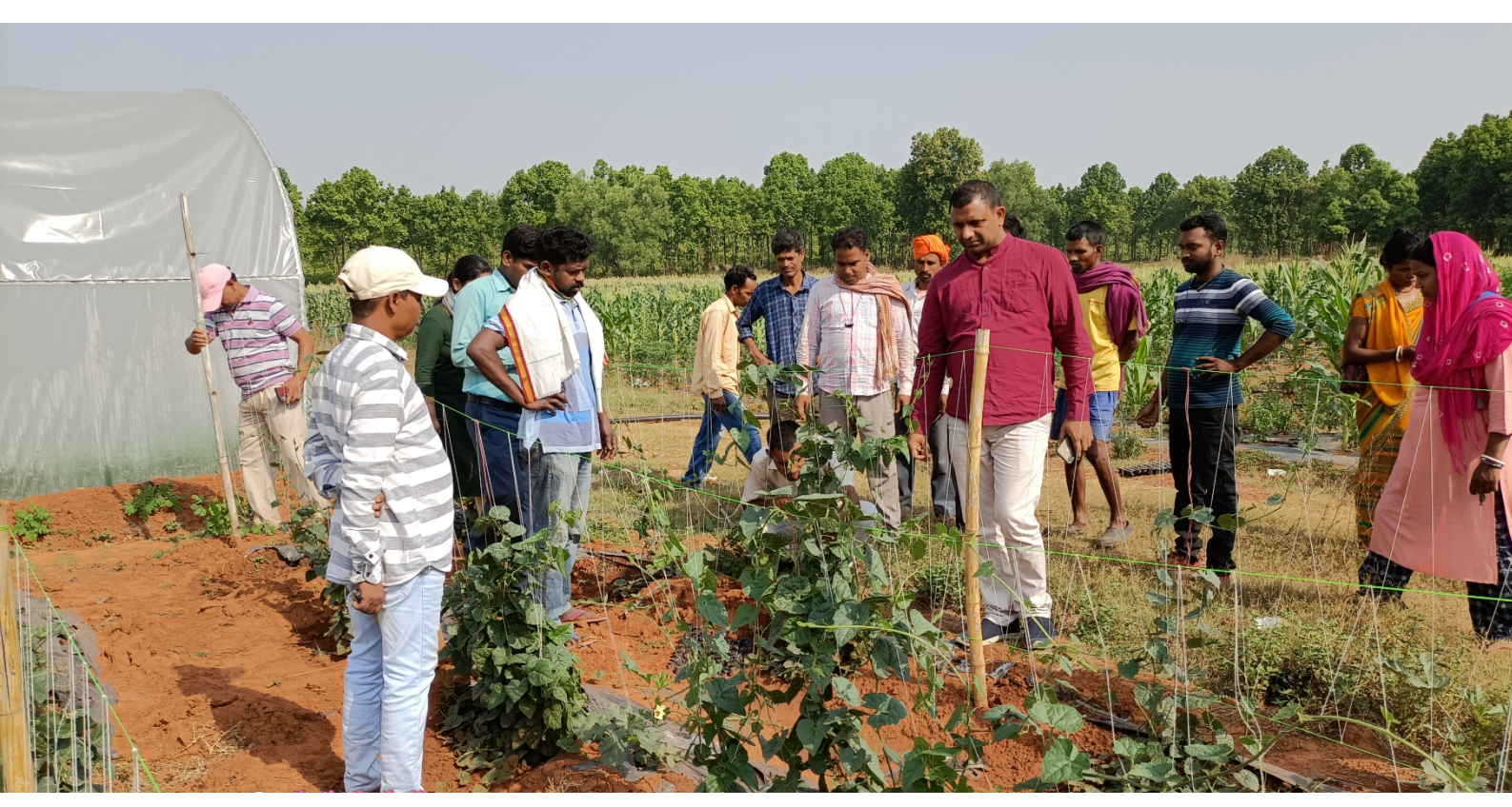
On-field training for farmers

FTC acts as a customized 'Solutioning' center where different solutions are designed to cater to subsistence farmers, surplus farmers, and star farmers by providing curated solutions to each of them. FTC is a residential training center with technologies identified and selected for different types of farmers. The center focuses on high value crops, increase in productivity, and it is market-oriented including exotic crops with export potential.