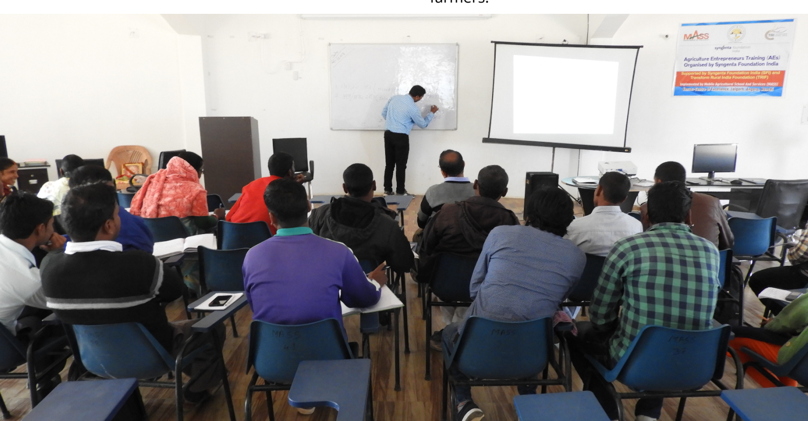
In house training of Agri entrepreneur and farmers at Angara Block, Ranchi District, Jharkhand, India

appropriate support to boost agricultural productivity. They play a vital role in scaling up of innovation and best practices. Farmer Technology Centre (FTC) is designed to address three issues pertaining to the existing practices in extension services. First, FTC brings in the required heterogenicity to the support offered to a range of farmers with different aspirations and needs, in contrast to the conventional homogenous approach where a single solution is promoted across entire communities and even across regions. Second, FTC adopts a 'two-way communication' approach rather than one-way communication to the farmers which prevails in most of the existing extension services. Third, FTC takes a 'human centric' approach instead of a 'technology centric' approach. The human centric approach helps in designing appropriate solutions based on the needs of various types of farmers.