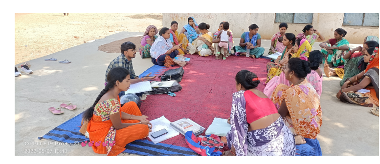
Meeting with Self Help Group Members

Improving agricultural practices is a function of overcoming structural, supply-side as well as demand-side barriers. While it is important to ensure continuous stream of inputs, along with the use of relevant technologies and technical know-how, as well as provision of subsidies, credit and insurance, many of the barriers to adopt appropriate and modern farming practices are behavioural in nature. Overcoming the behavioural barriers warrants adopting an empathy-led approach, which involves experiencing the world from farmers' perspective, and to view life from their living conditions, taking a closer look at the way they process information and make decisions.