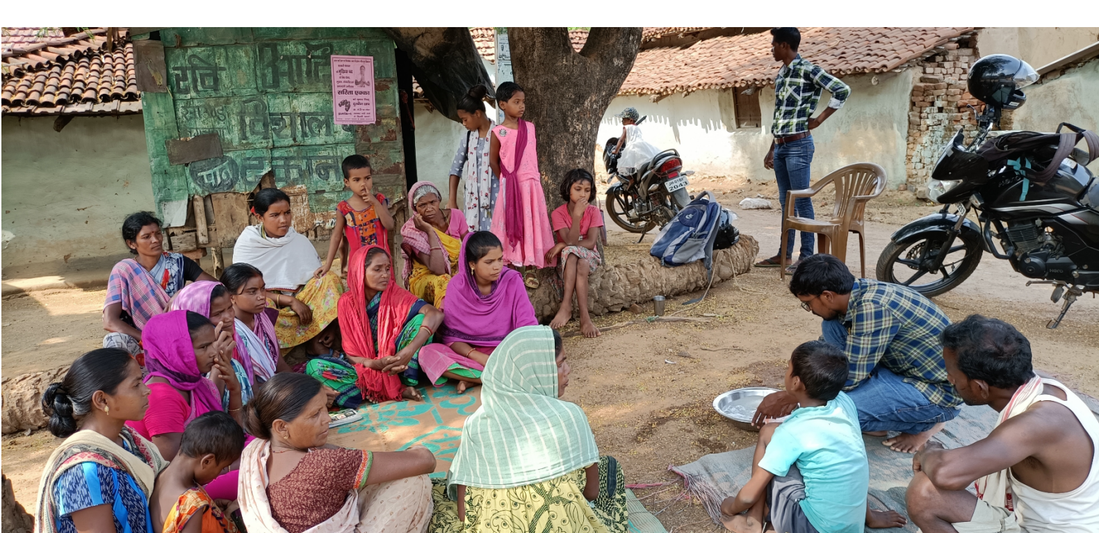
Training farmers on seed treatment of paddy