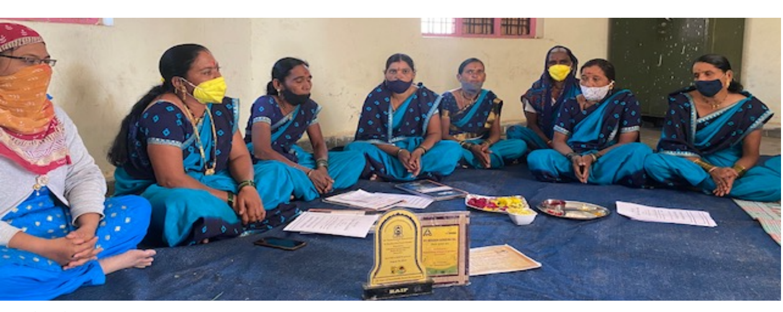
Members of SMG Custom Hiring Center

SMG is an all-women Self-Help Group (SHG) in Srirampur village in Nashik District. ITC is supporting them since 2018, by providing farm machinery/equipment. The group rents out the machinery (roller, mulcher and tractor) to farmers to help them in their activities, which saves time and financial expenditure. Since every farmer cannot afford to buy such equipment, having them on hire is proving to be a boon to them. The services of SMG have benefitted around 216 farmers to date. SMG is planning to invest the additional income in new business ventures like storage space for onions. Through such interventions, the PPCP projects are mainstreaming gender and supporting women towards holistic water and livelihood management in command areas.