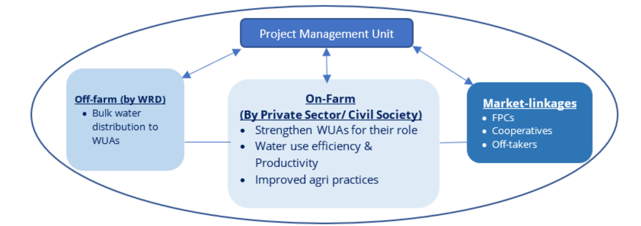
Figure 2: PPCP Model for Integrated Water Use Efficiency and Productivity

Further deliberations led to the idea of designing and implementing appropriate Public-Private-Civil Society Partnership (PPCP) models to achieve integrated off-farm and on-farm water use efficiency and productivity while also strengthening market linkages. As this would require inputs and coordination with other public sector agencies such as the state Agriculture Department, Soil and Water Conservation Department and others, it was decided to create a Project Implementation Unit (PIU)<sup>4</sup> with representation from all the concerned departments. The framework for PPCP projects is shown in Figure 2, below.