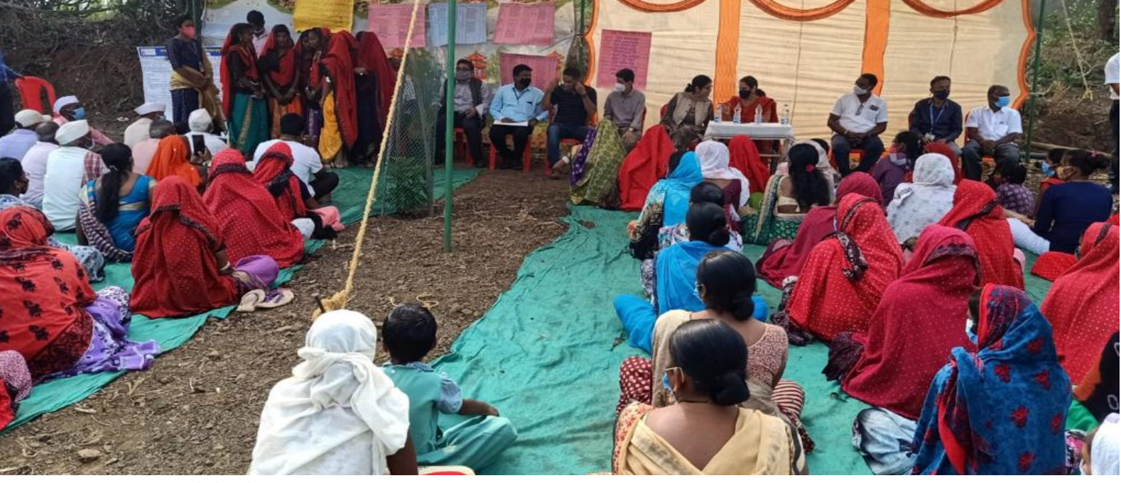
Community meeting in Nandurbar district