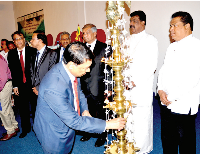
Dignitaries on Dias (left) and Lighting the Lamps (right)