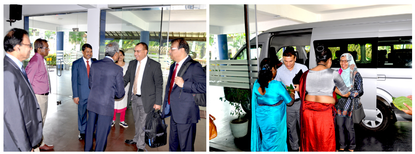
SLCARP Officials Recieveing Guests and Participants