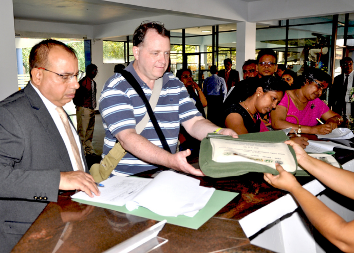
Registration of Participants