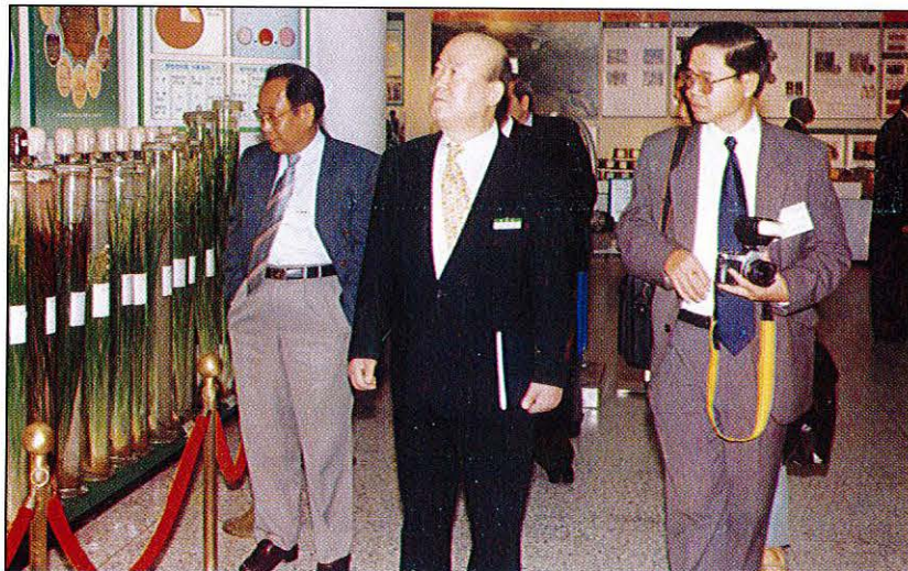
Participants visiting the RDA Museum