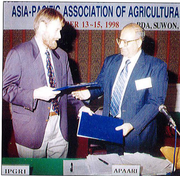
Signing of MoU between APAARI and IPGRI